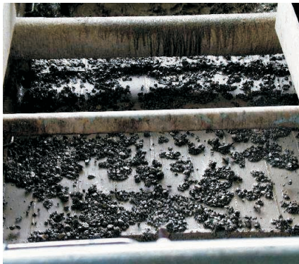
Cuttings from the highly reactive gumbo section in the Gulf of Mexico drilled with the new water-base system.

suppressant provides shale hydration inhibition. The new product intercalates and reduces the space between clay platelets so that water molecules will not penetrate and cause shale swelling.