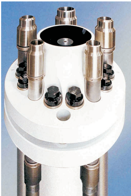
The Stewart & Stevenson patented dual gradient coupling is in service on deepwater drilling rigs.

Use of a fluid return line will not only be used in dual gradient drilling, it also offers advantages in conventional drilling.