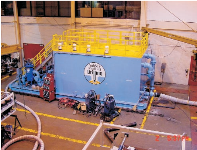
The seawater filter skid is used to clean the seawater power fluid prior to pumping it subsea. Seawater powers the SMD system subsea pump.

ventional drilling is not present in dual gradient drilling.