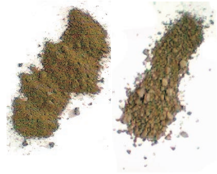
Cuttings are shown from drilling through sand (left) and from drilling through a shale section.

The amount of drill cuttings that is being processed out of the CVDH is regulated by adjusting the pressure of the pneumatic cylinders that control the choke plate and the auger RPMs.