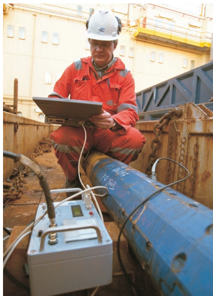
Study of North Sea wells shows drilling with rotary steerable systems reduces tortuosity.

In tangent sections drilled with the rotary steerable system, superior inclination hold performance was observed